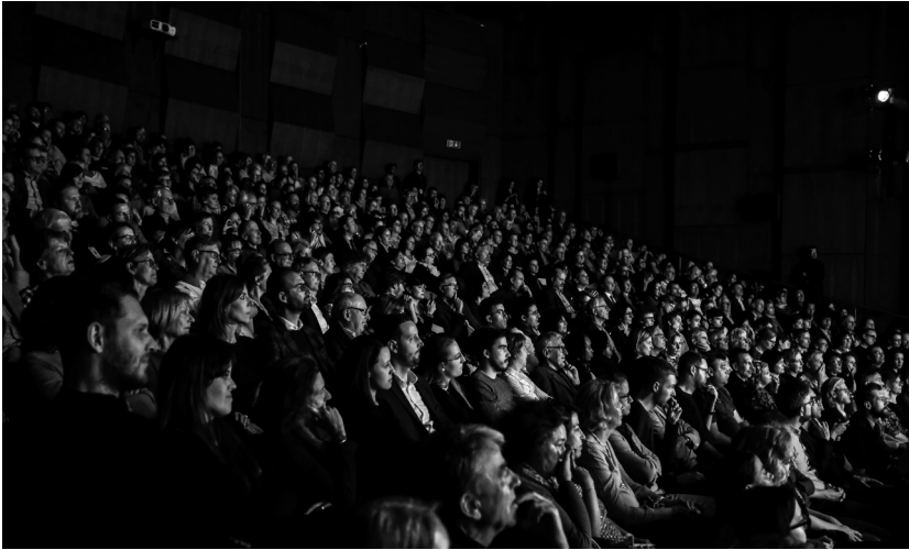
Théâtre de Marens 2019 ↗