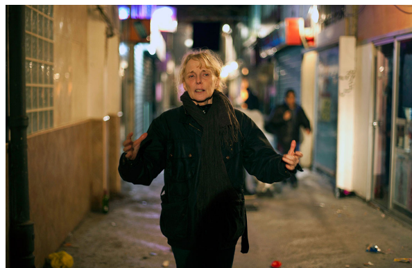
Claire Denis ↗

All the information regarding these encounters, as well as the arrangements for participation, will follow on the Visions du Réel website.