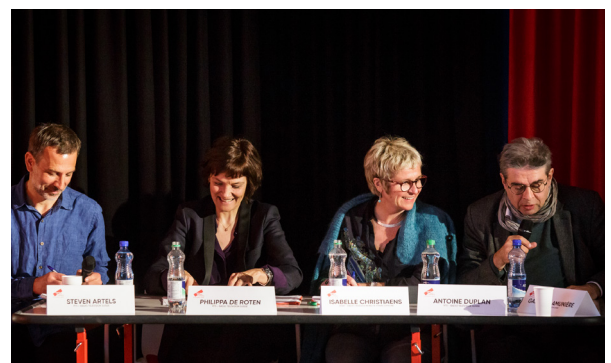
Industry 2019 ↗