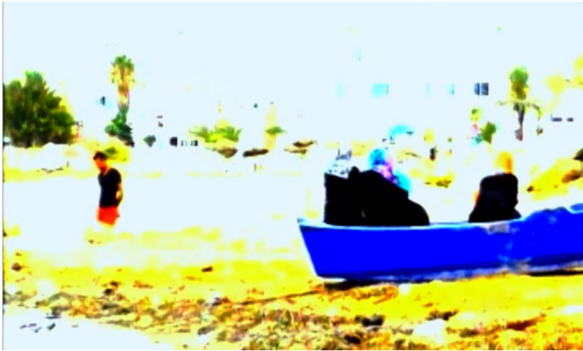
Le Livre d'Image ↗

The Festival presents sentiments, signes, passions – à propos du livre d'Image , an all-new exhibition conceived with Jean-Luc Godard. A carte blanche to the filmmaker, entitled passions, signes, sentiments , should also have been on the programme of the 51st edition of the Festival.