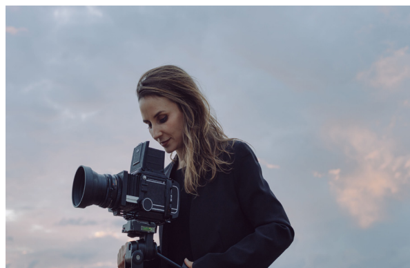
Petra Costa ↗